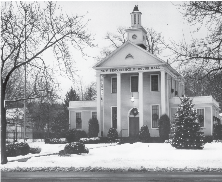
New Providence Borough Hall, 1969

Over time the Administration also outgrew the space and in 1980 moved into the former Lincoln School across Academy St. The Borough still owns the building and has leased it to various tenants for forty years. It is currently serving as the local branch of Peapack Private Wealth Management.