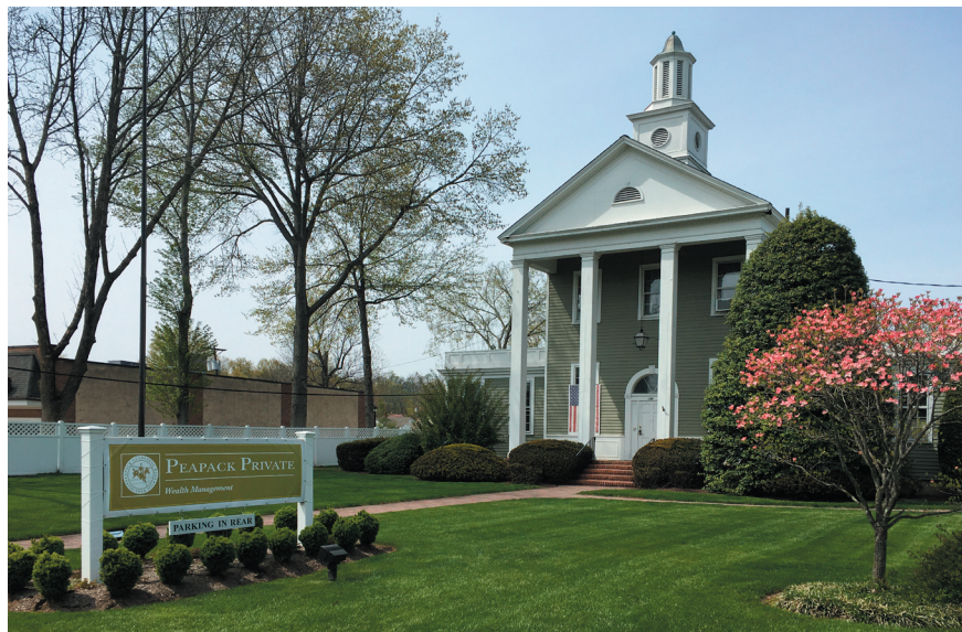
Peapack Private Wealth Management, 2021

This summer, the Historical Society plans to erect a second New Providence historical marker on the property to serve as a constant reminder of the Academy's role in the history of our town