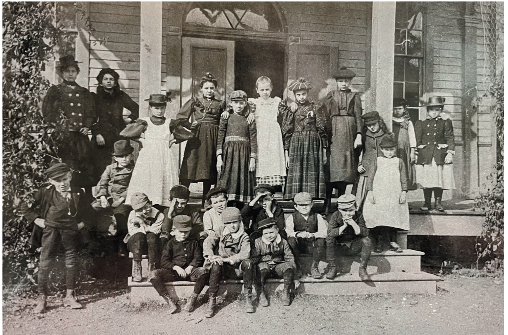
The Academy, circa 1894

For over 150 years, the Academy building at the corner of Springfield and Academy has served the Borough of New Providence in many significant ways. From 1870 to 1917, it served as the primary school for the Borough (Grades K-12). As the town's population increased, students moved into more extensive facilities and the building was repurposed to become Borough Hall.