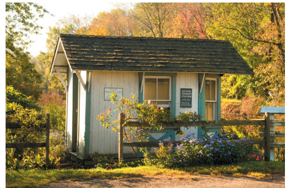
A restored bridge tender's station along the D&R Canal.

The Annual Dinner will be held on April 14th at a new venue, the Murray Hill Inn & Suites.