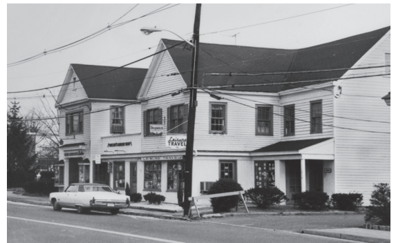
A view of 1312 Springfield Avenue from the past.

All-State Insurance and former K-Line Transportation Building, on the corner of Mountain Avenue and South Street, has been razed by Erickson Living for the construction of a continuing care retirement community. The development is called Lantern Hill .