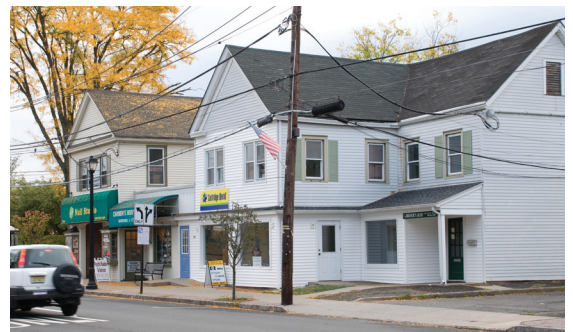
1312 Springfield Avenue in October 2014.